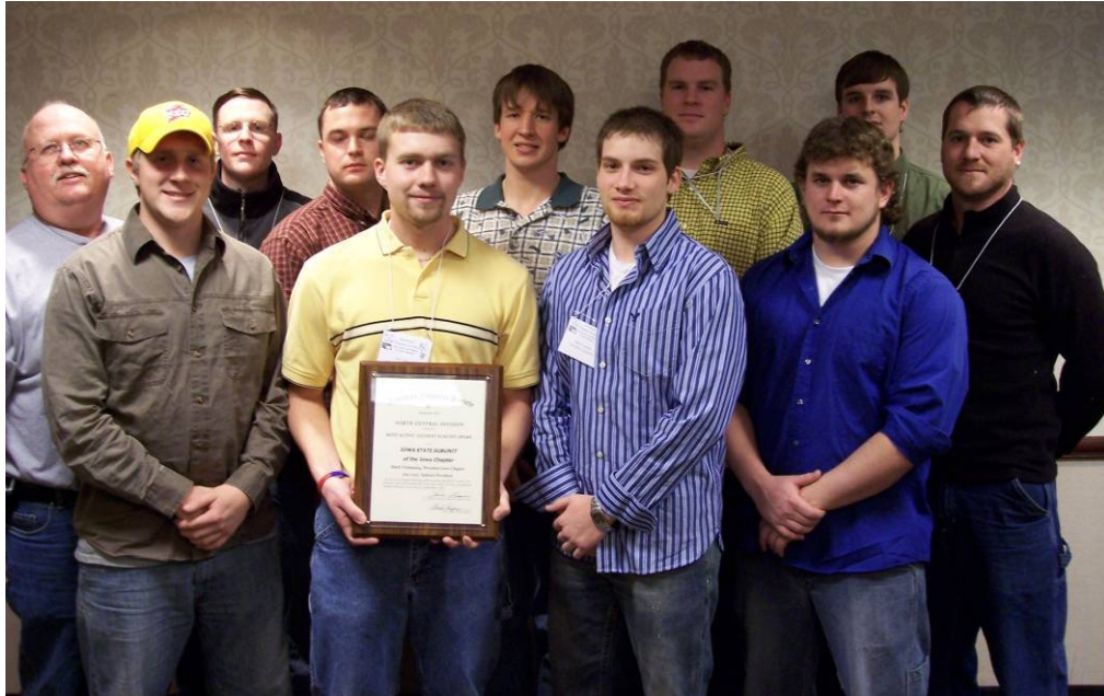
“The Iowa State University Student Subunit was awarded the North Central Division Most Active Student Subunit along with the Southern Illinois Student Subunit. Subunit members and sponsors pose with their award”