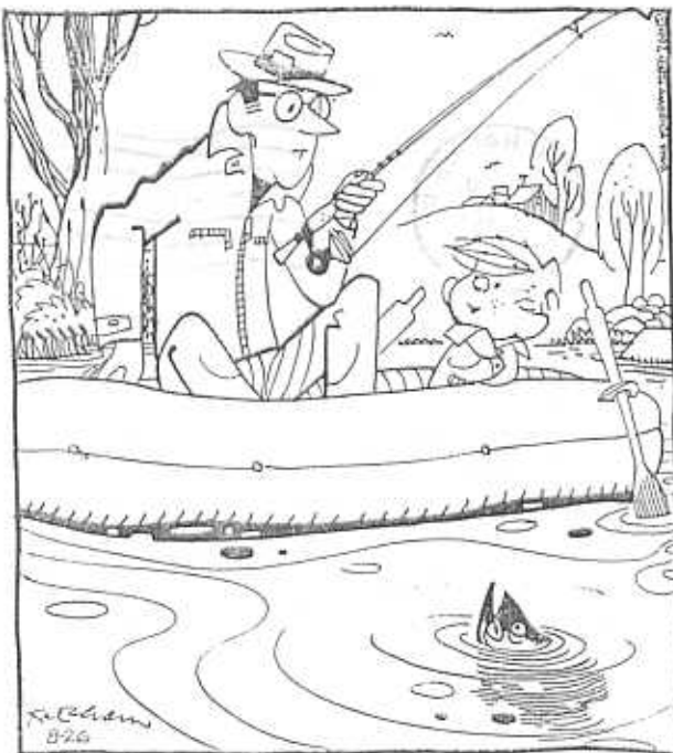
Dennis the Mensce