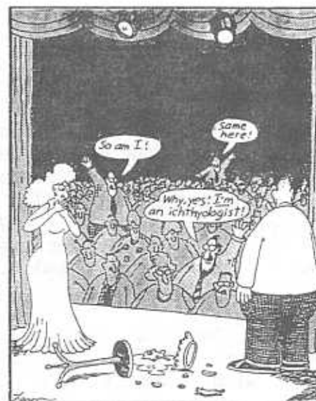
A lucky night for Goldy