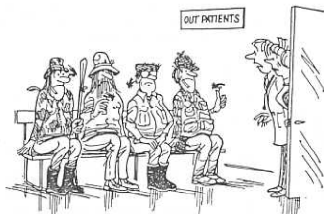
"I see the trout fishing season has started again!"